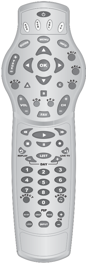
Part Number ICX18346, version 1.0 07012004

VISIT US ON THE WEB YOU CAN FIND PROGRAMMING INSTRUCTIONS AND CODES FOR ALL OF OUR REMOTE CONTROLS, AS WELL AS INFORMATION ABOUT OUR OTHER PRODUCTS ON OUR WEBSITE: www.icxglobal.com